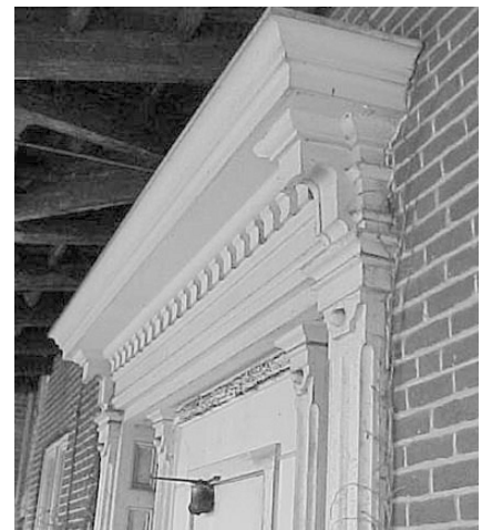
Lyman Mansion, exterior detail

Despite the obvious historical significance of the site and individual buildings, the University of Virginia and its Foundation have for many years followed a policy of demolition by neglect. They have also explored especially unimaginative and wasteful redevelopment plans that anticipate the demolition, rather than the adaptive re-use, of historic buildings. Anxious to open a new visitors' center and main parking area, Monticello signed a preliminary agreement to pay up to 3 million dollars toward the demolition of the sanato-