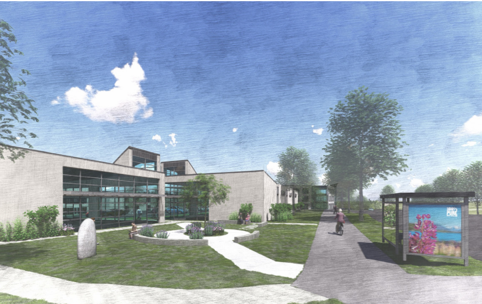
Artist's rendering; Park/Bus Stop at 5th Street & Old Lynchburg