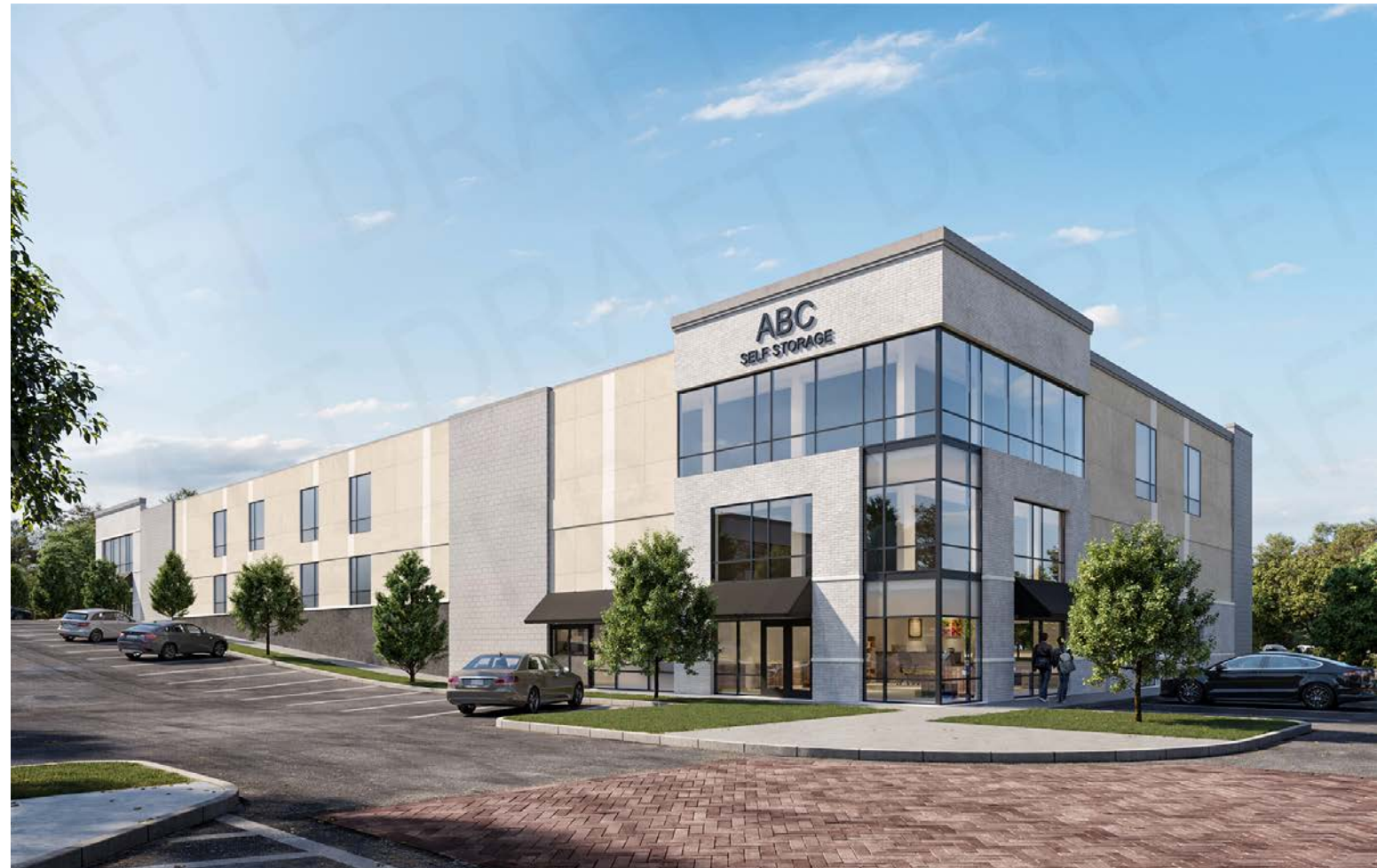
Artist's rendering; Storage Building

Positive value to surrounding properties, workers and homeowners