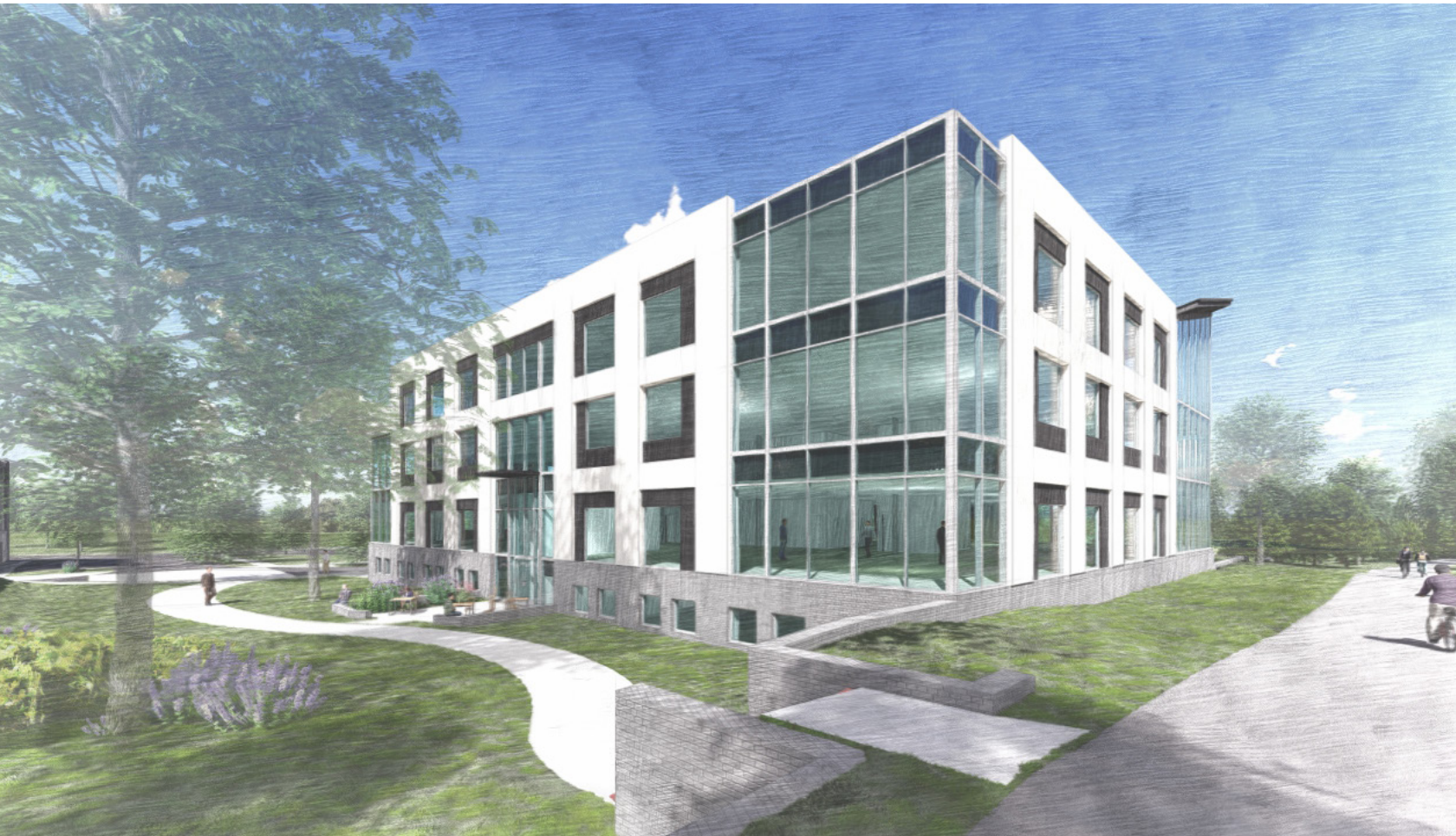
Artist's rendering; Interior Office Area with Greenspace & Park